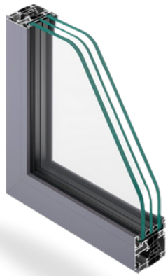
NC 65 HES

The project exclusively incorporates Metra's advanced systems to achieve an innovative and efficient facade: